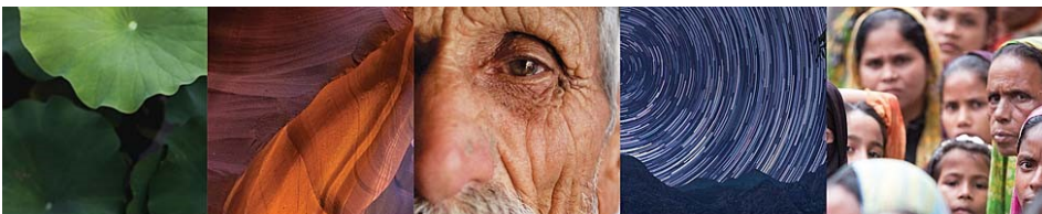
2017 LOTTIE MOON CHRISTMAS OFFERING®

Training uses a biblical, systematic, portable and comprehensive approach to providing the foundational equivalent of a seminary education. Training consists of 520 hours of interactive classroom lecture and discussion under the supervision of a qualified teacher. More information available here and here .