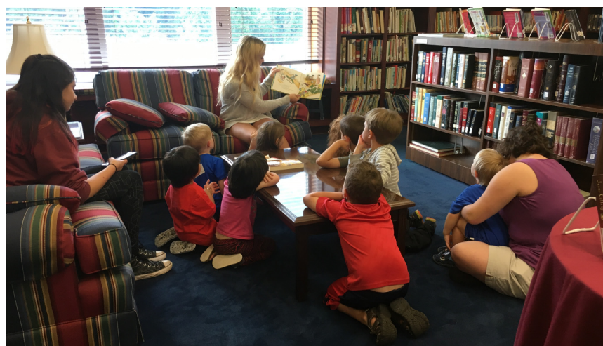
Our preschoolers visit the church library for story time each Wednesday during the WoW service.

education, swimming, games, rope courses, adventure.