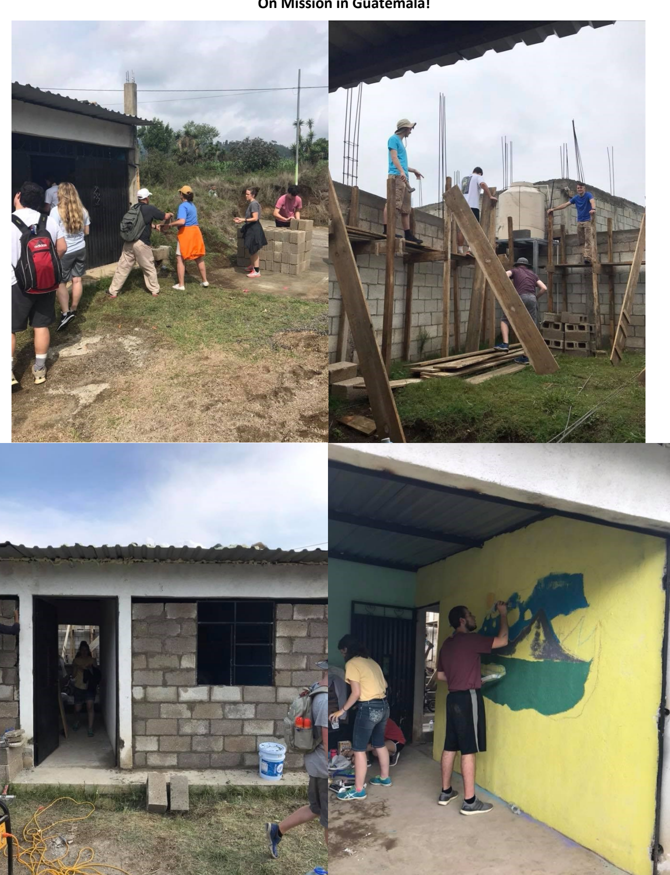
Building a security wall with concrete block work at an after school program location. Adding murals to the walls of the center.